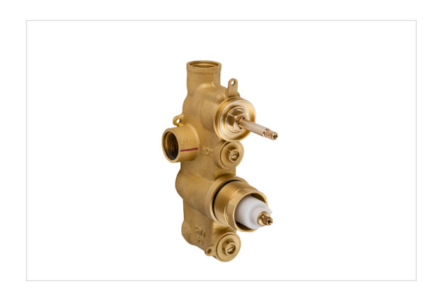
Limited lifetime. Commercial